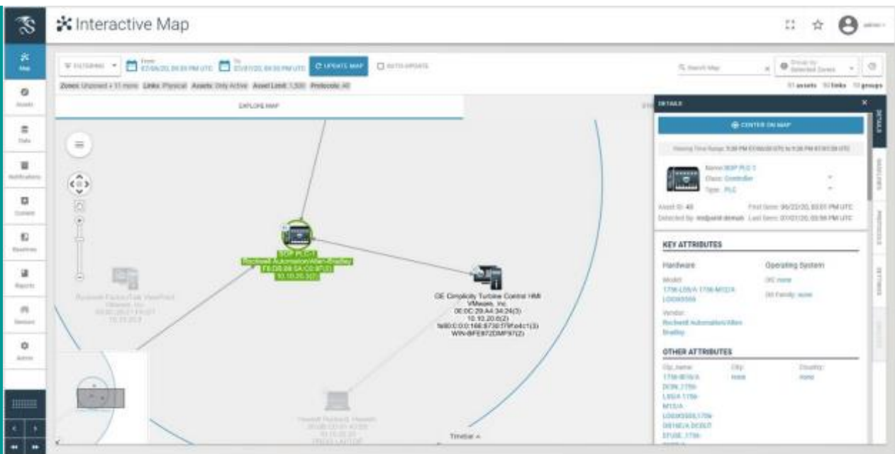
Figure 1: Example of an asset in the Dragos Platform and some of the available attributes.

Through the integration, users can now visualize their OT environment with their ServiceNow deployment. The Dragos Platform Site Store responds to scheduled queries set by the administrator of the ServiceNow ServiceGraph Connector App, to deliver Asset Information, and related Vulnerability information to the ServiceNow instance, such as Asset Type, Vendor, Model, Addresses (MAC, IP, Hostname), VLAN, Location, Firmware version and Operating System (OS).